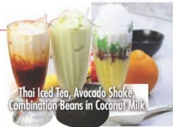
Thai Iced Tea, Avocado Shake, Combination Beans in Coconut Milk