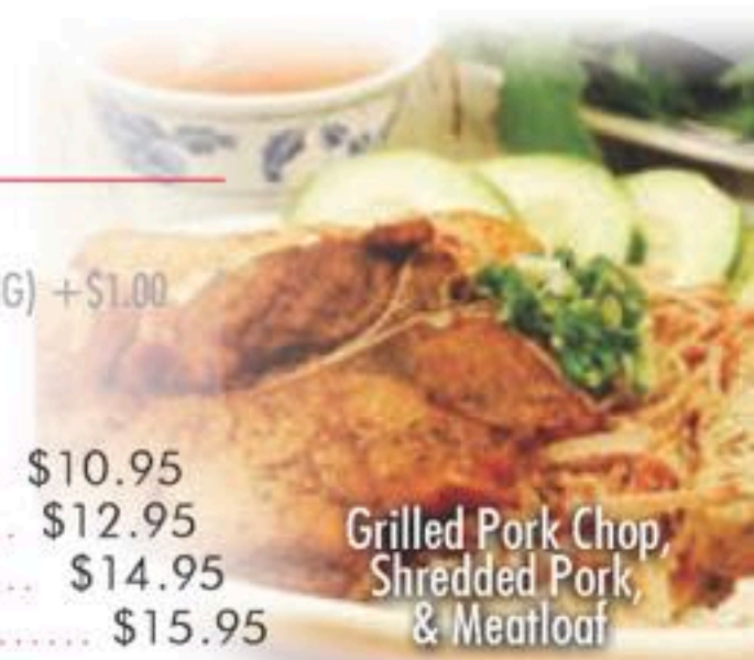
Grilled Pork Chop, Shredded Pork, & Meatloaf

ADD 1 EGG (SUNNY SIDE UP)*$1.00 SUB BROWN RICE $2.00 SUB FRIED RICE $3.00 *COMBINING SAME ITEMS SHRIMP OR PORK CHOP UPCHARGE $3.00