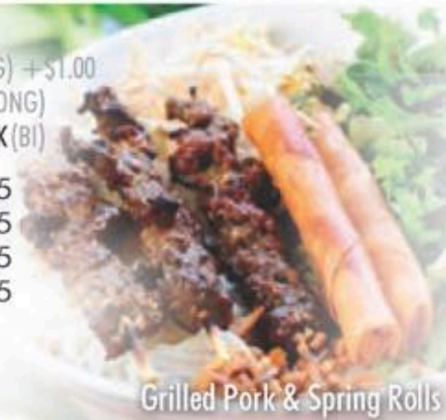
Grilled Pork & Spring Rolls

*COMBINING SAME ITEMS SHRIMP & SHRIMP PASTE UPCHARGE $3.00 ADDITIONAL TOPPINGS $4.00